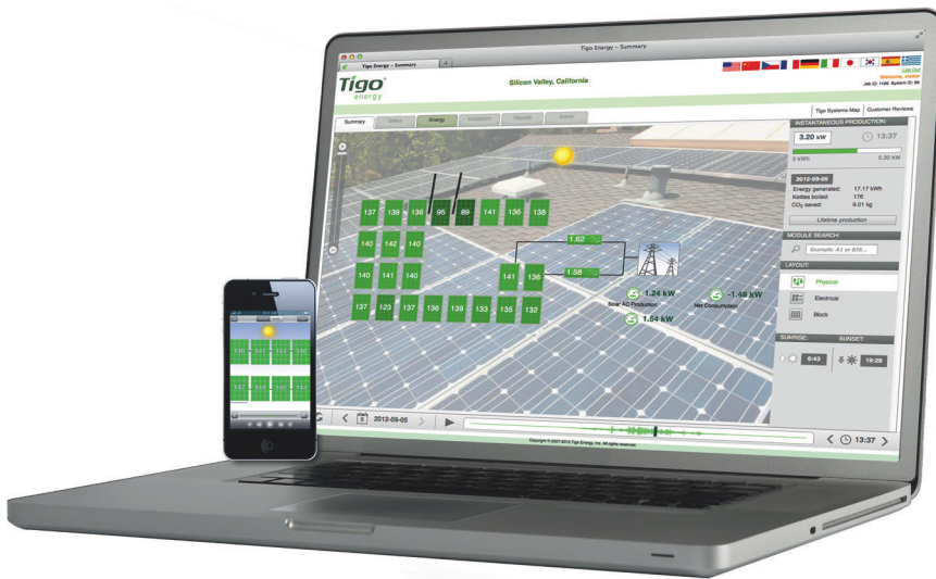
Tigo optimisation technology measures every panel every two seconds.

“A solar farm is set up in a very similar manner. There is often a Red Lion switch on each solar panel itself that will tie back to a central monitoring