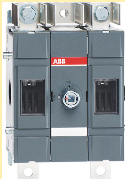
ODTC200US11 - solar switch. Courtesy of ABB, Inc.