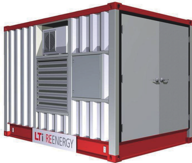
The LTI REEnergy PVmaster with Ampt Mode™ is in a new class of lowest cost, highest performing large-scale solar inverters. This HDPV-compliant inverter's output power rating is increased 60% when deployed Ampt DC/DC converters to lower costs by 40% while operating at greater than 98.6% CEC efficiency.