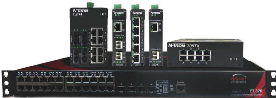
Red Lion technology allows wind and solar to transmit data swiftly and securely over long distances.