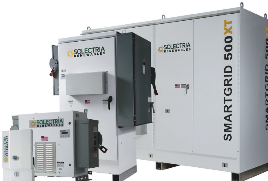
Solectria family of Inverters for all market sizes.

centrally managed at the inverter," Gun explains.