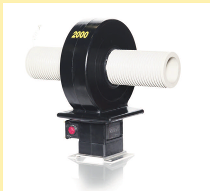
The ABB LG(X) current transformer is a popular choice for North American wind farm developers. This unit features high accuracy.

A key player in the global market is ABB . The company's Medium Voltage Distribution Components Facility is located in Pinetops, NC, USA. Jon Rennie, Vice President & General Manager, is responsible for distribution, automation and components. "These are products used on sub-stations and feeders to measure current and voltage for both metering and production applications. Current and voltage instrument transformers are products that take current and voltage from dangerous levels and reduce them to safe levels to be measured."