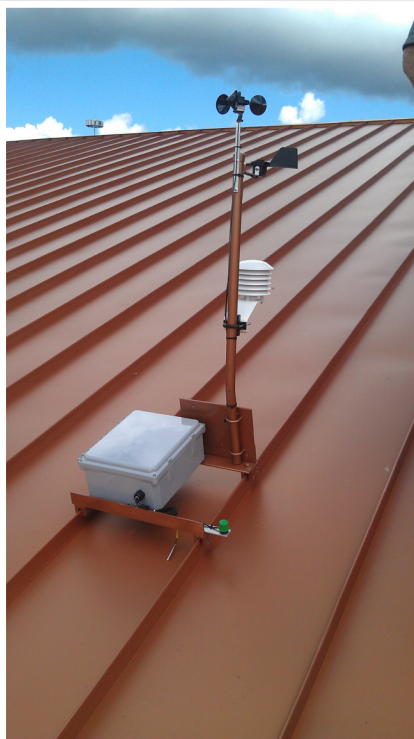
Yaskawa - Solectria Solar's weather station can withstand the harshest weather conditions.